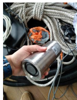
Working in the marine project